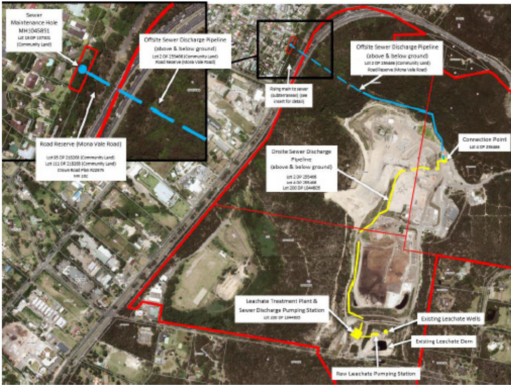
Figure 2: Aerial view of the site including proposed development