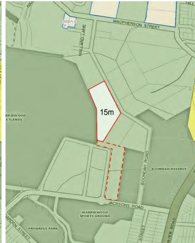
PROPOSED HEIGHT LIMIT 15m