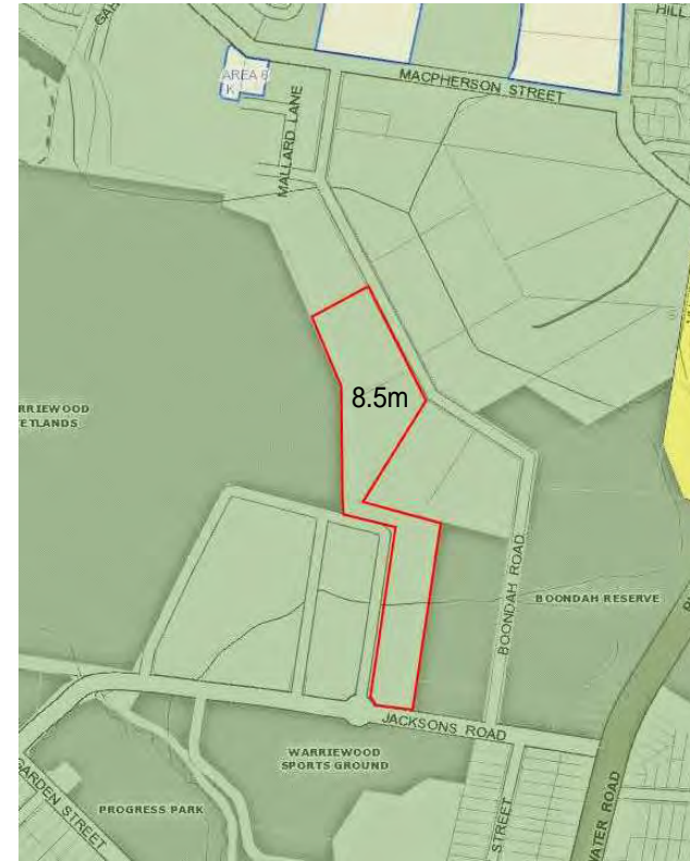
CURRENT HEIGHT LIMIT 8.5m