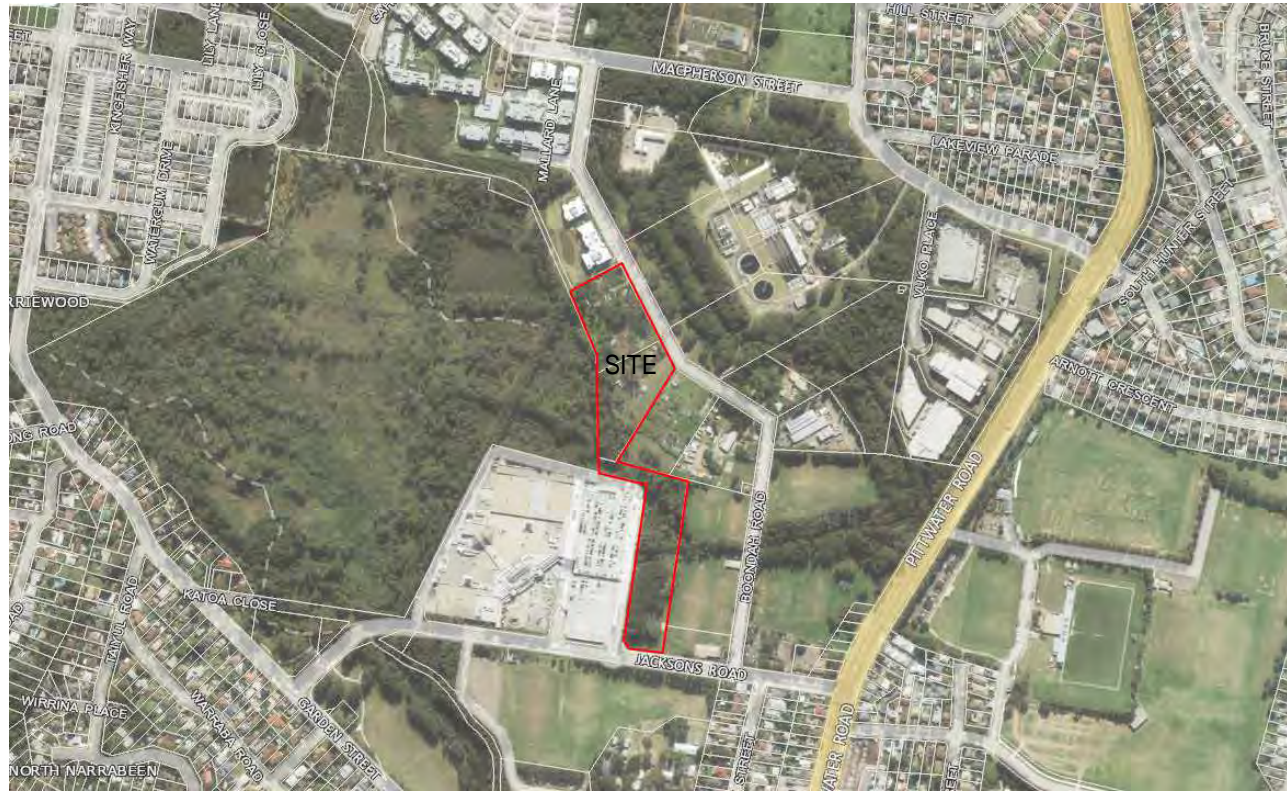
SITE LOCATION - AERIAL