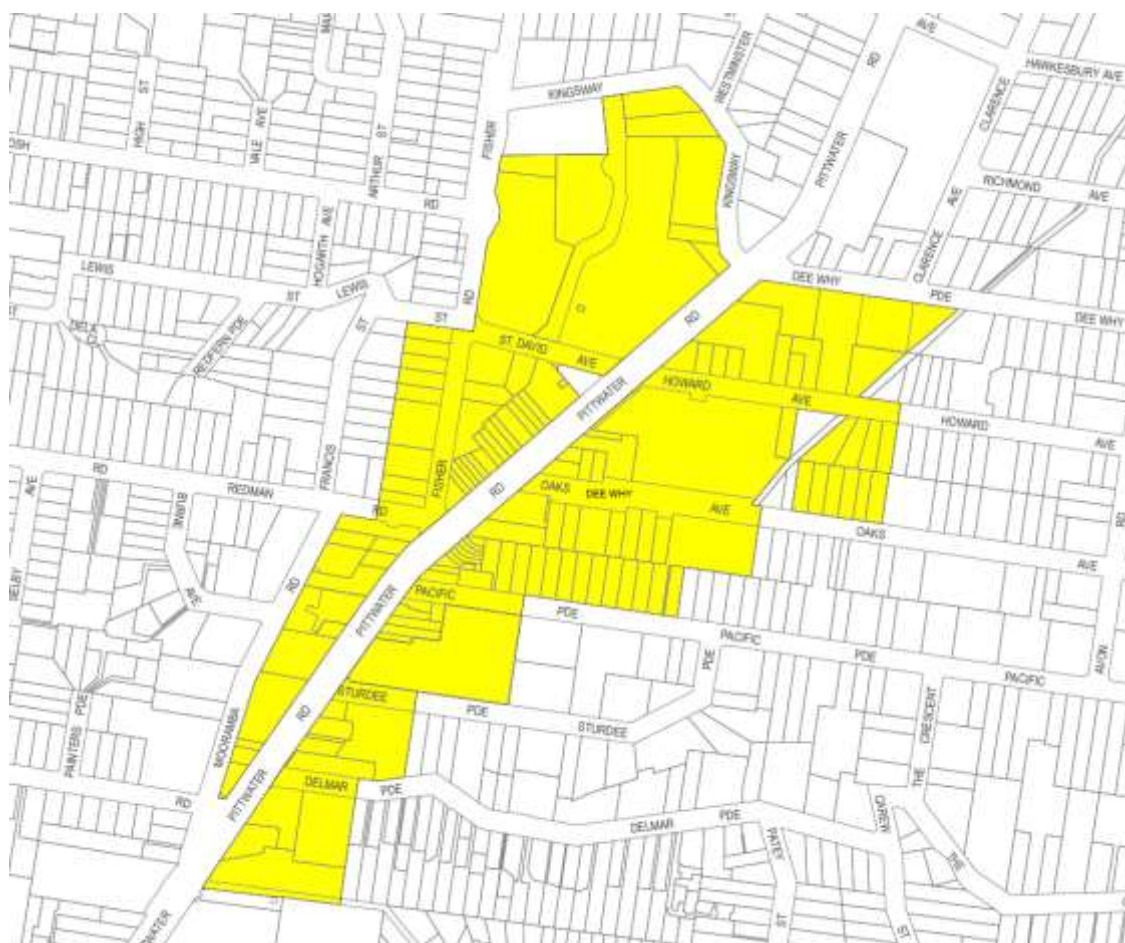
Figure 1 – Dee Why Town Centre

Further changes to WDCP 2011 were publicly exhibited from 13 October until 11 November 2018 (WDCP 2011 re-exhibition). The re-exhibition was considered necessary as proposed changes to the DCP originally exhibited in February/March 2018 were considered significant. This report summarises the outcomes of the WDCP 2011 re-exhibition and recommends the adoption of amendments to WDCP 2011.